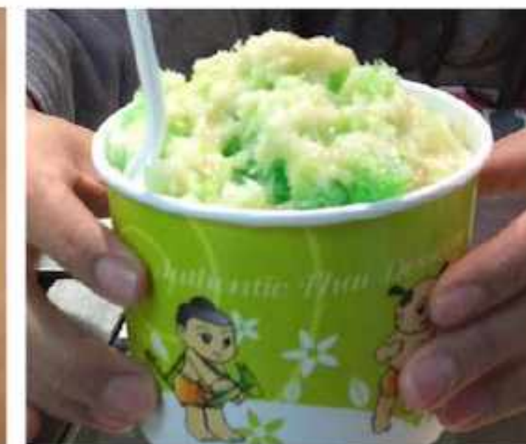
Thailand: Nam Khaeng Sai