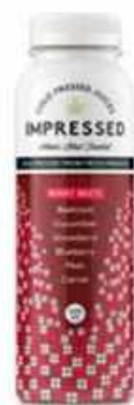
Impressed Berry Beets Cold Pressed Juice