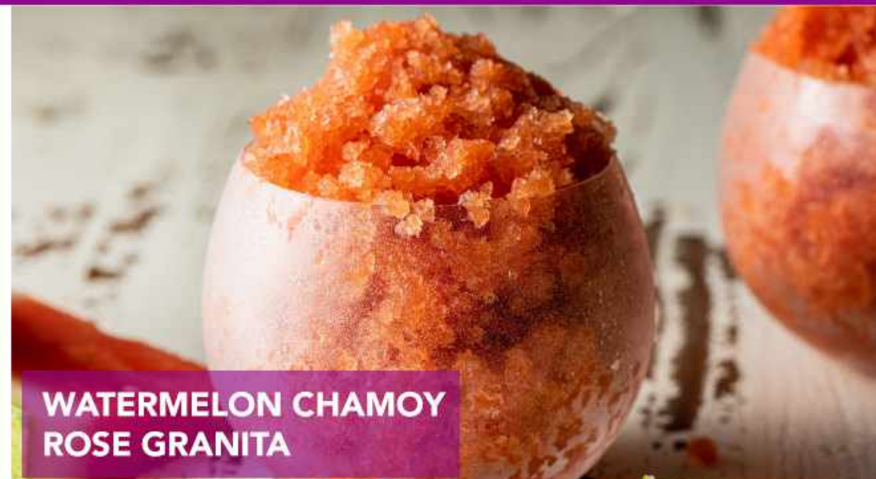
WATERMELON CHAMOY ROSE GRANITA

Bold, concentrated flavours from fresh fruit syrups, bitters, sours and spices guarantee they won't get diluted as the ice melts.