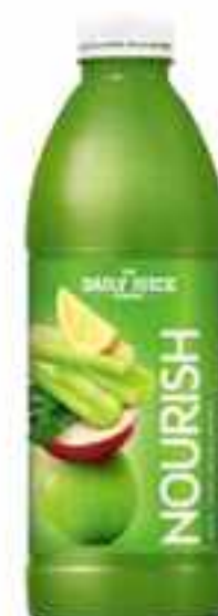
The Daily Juice Company Nourish Apple, Celery, Lemon & Spinach Juice