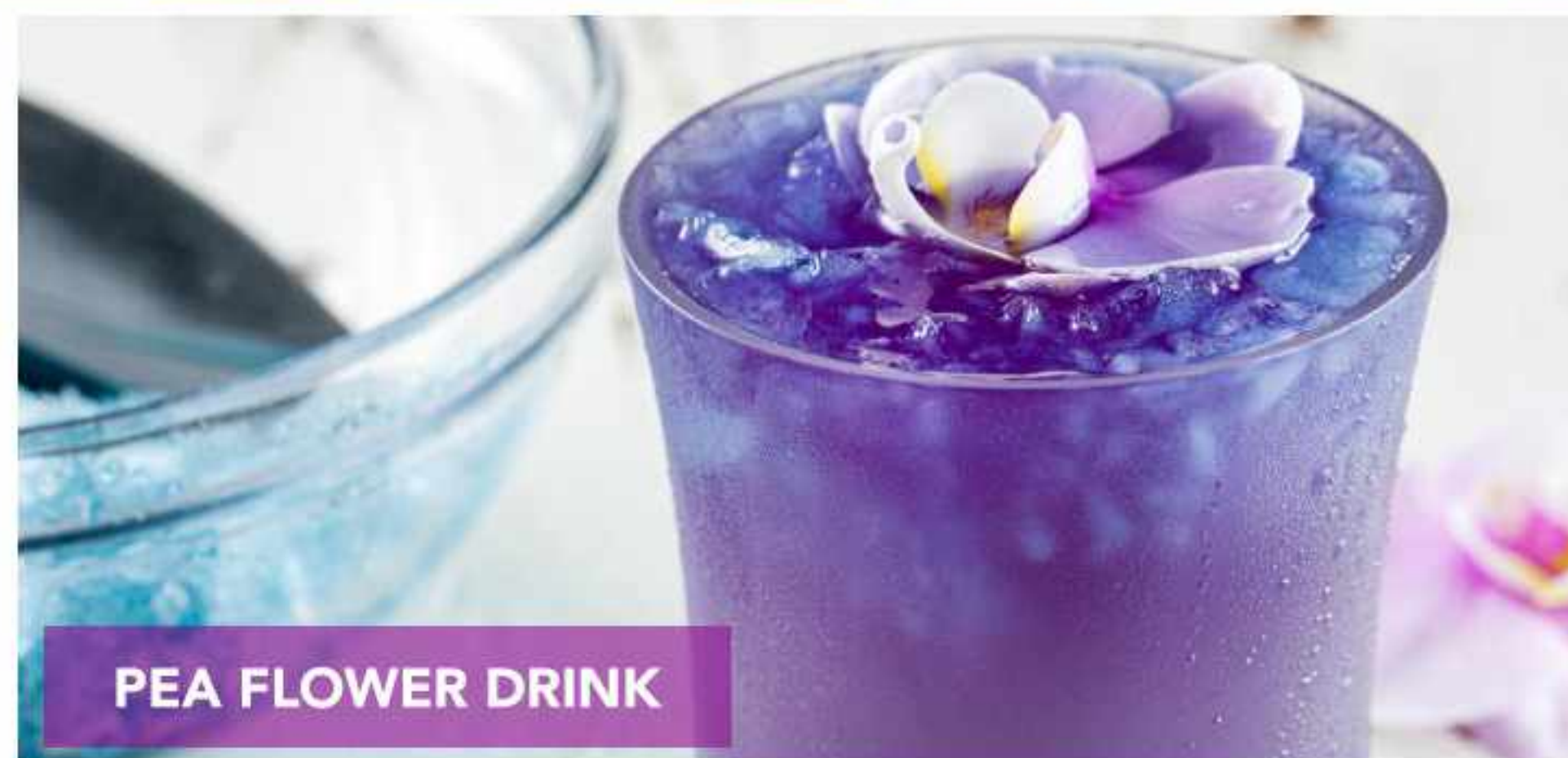
PEA FLOWER DRINK