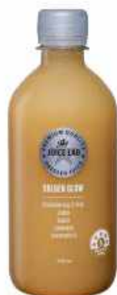
The Juice Lab Golden Glow Premium Pressed Juice

The flavour components common to the trend all increased from 2013 to 2015 such as beetroot, ginger and vegetable flavours.