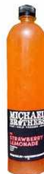
Michael Brothers Strawberry Lemonade Pressed Juice