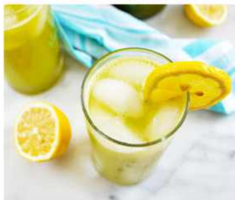
Middle East Mint Lemonade