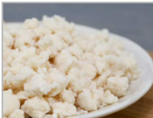
OKARA-SOY BEAN PULP