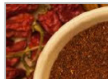
CHIPOTLE & ANCHO CHILI PEPPER