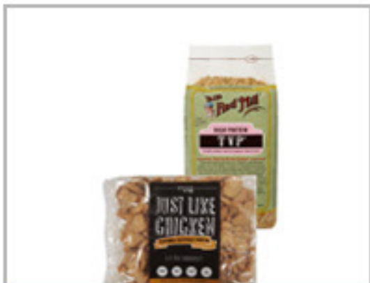
TVP- TEXTURED VEGETABLE PROTEIN